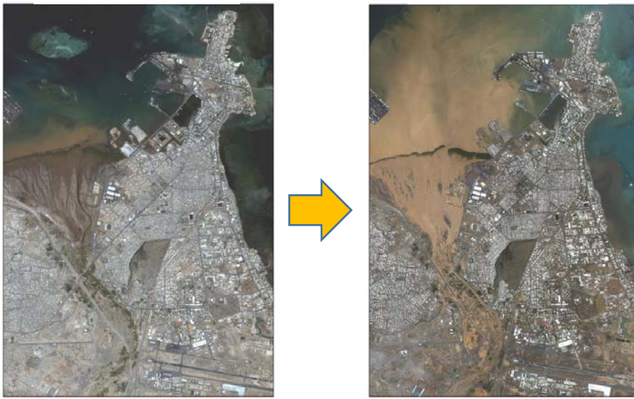
AFTER (May 20, 2018)